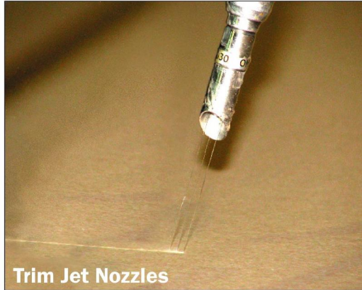
Trim Jet Nozzles