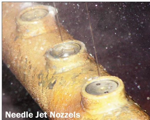
Needle Jet Nozzels