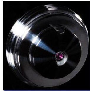
German Patent- and Trademark Patent No. 10 2005 025 583

World record at 2014 m/min: PM62 Holmen Paper Madrid, 25.01.2010